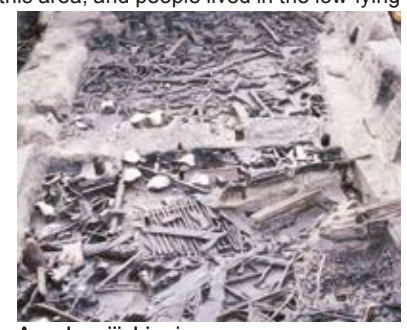
Aovakamiiichi ruins Yayoi-period objects excavated from the ruins

wetlands by the lagoon; the wetlands' clay layers containing a large amount of moisture happened to create an airtight environment and prevent organic substances, including wood, from being decomposed by bacteria. That is why many well-preserved ancient objects were excavated from the ruins, which is called an "underground museum of the Yayoi period." Moreover, a brain was discovered in the excavated skull of a Yayoi-period person, and became a focus of public attention. Even in global terms, only several reports have so far been made on discoveries of human brains dating back to the prehistoric